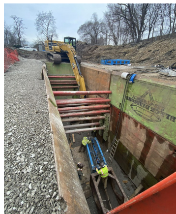
Crews work in large sewer trench on Mellon Terrace

The launch of this project comes off the heels of the